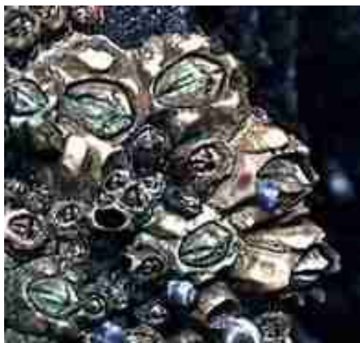
Happy Barnacle Family

P.O. Box 98700, Des Moines, WA 98198 (206) 824-3674