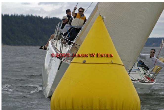
Snake Eyes races to the mark

P.O. Box 98700, Des Moines, WA 98198 (206) 824-3674