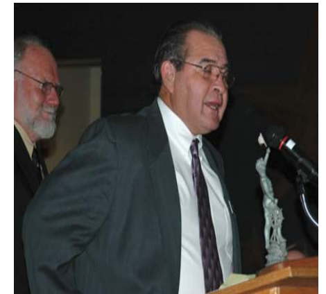
Moments caught throughout the Change of Watch, October 17, 2007