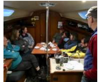
3 rd Course on Stella Maris