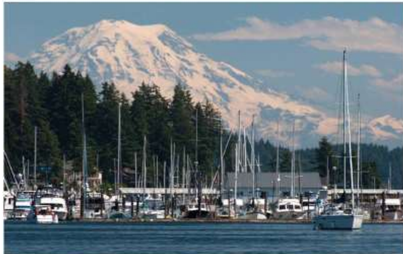
Mount Rainier and Gig Harbor

But sign up early. This is a busy time in Gig Harbor and we only have 10 spots reserved. Call (253)-851-1793 by May 20 to reserve your space