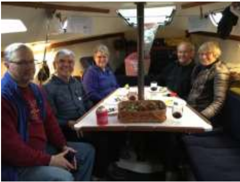
1 st Course on Hobbes

Sunday the rain stopped long enough for breakfast goodies on dock and then parade watching with popcorn. As soon as the parade was over we headed home as the winds were picking up again.