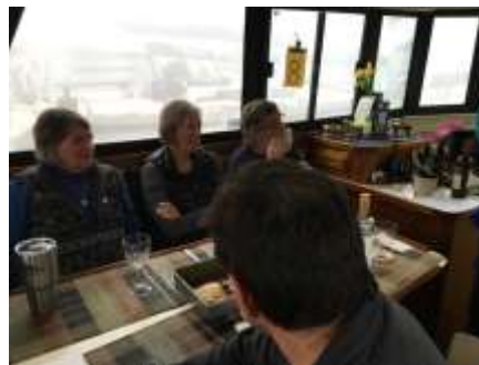
2 nd Course on Viva