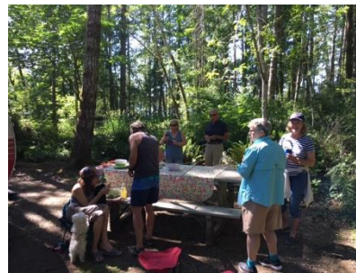
Smores were served at 5:00, the music