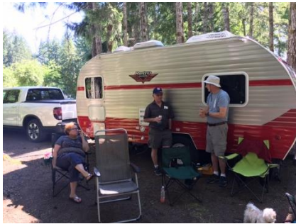
Red Dwarf and guests started

The Land Party at Jarrell Cove was fun and intense?